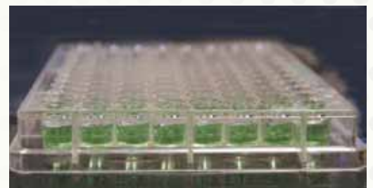
96 well plate for the Model 960