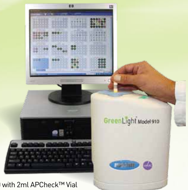
Model 910 with 2ml APCheck™ Vial

...and this results in safer foods for consumers.