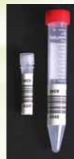
APCheck™ vials for the Model 910 available in two volumes: 2 ml and 15 ml