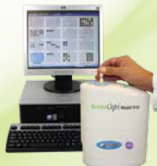
Model 910 with a 2 ml APCheck™ vial

The Model 910 uses the same preparation used for agar plates (no further dilution is necessary) with samples being placed in an APCheck™ vial already containing the sensor. Readings are obtained by placing the APCheck™ vial into the sample receptor cavity of the instrument and results are recorded in the GreenLight™ software.