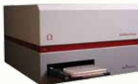
Plate Reader for the Model 960

A simple “mix and measure” assay 96 well plate system: Using food homogenates (prepared as for traditional APC testing with no further dilutions necessary) (ISO:4833:2003), sensor, sample and oil are added in sequence and resultant aerobic APC values are quantified using an appropriate calibration. The plate is measured kinetically on a fluorescence plate reader.